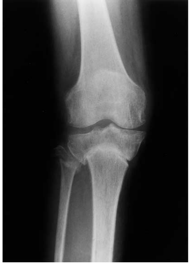
Fig. 2 An example of postoperative radiograph. The fibular head is morselized and deformed with correction of varus deformity

Bony union at the fibular osteotomy site was seen in all cases in group A, with no local discomfort at 1 year after operation. However, in group B a bony union was seen in only 28 cases. In 38 cases there was atrophic non-union and in 14 cases a hypertrophic non-union. Pain and tenderness at the osteotomy site in this group were seen in two cases and five cases, respectively (Table 3).