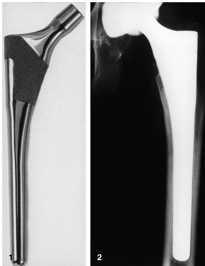
Fig. 1 Opti-Fix femoral component; tapered design with proximal porous coating

The Opti-Fix femoral stem is a tapered stem made of a Titanium 6 Aluminum 4 Vanadium-Alloy with a proximal coating of Titanium beads (Fig. 1). In addition to the Optifix femoral stem, 69 of the procedures incorporated an Opti-Fix porous coated acetabular cup, ten received a Dual Geometry-cup (Osteonics) and one incorporated a Reflection-cup (Richards). Two head sizes were used 28 mm (19 hips) and 32 mm (61 hips). There were 36 ceramic and 44 metallic heads. Stem diameters were determined using preoper-