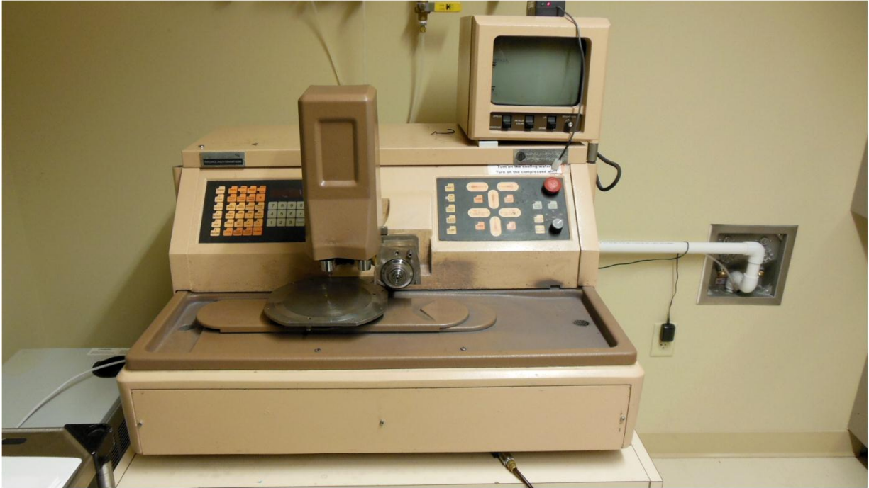
Fig. S1 Micro Automation Model 1100 micro-dicing saw.