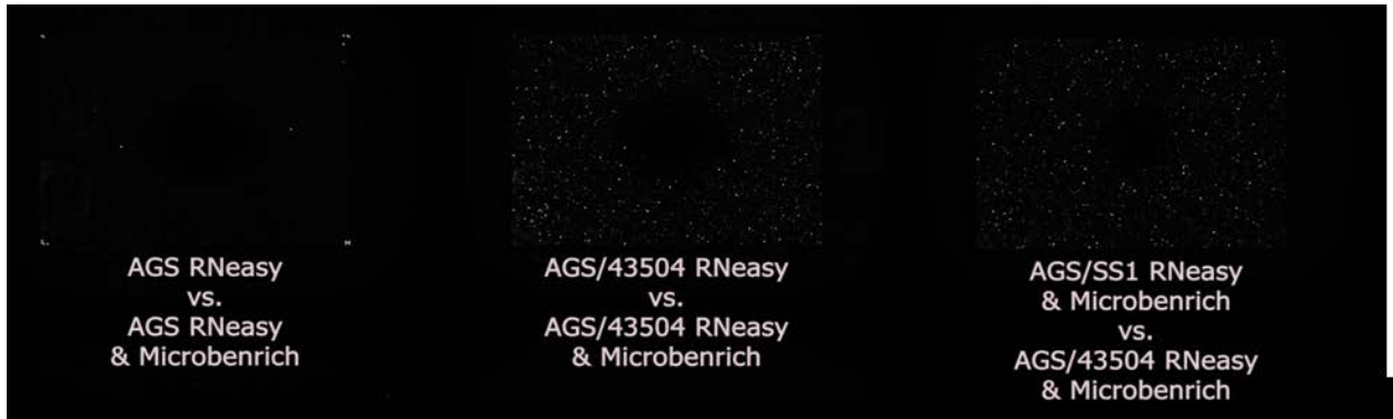
Figure S2. Eukaryotic RNA does not bind to custom H. pylori microarrays ( left ), but hybridization is observed in samples containing bacterial RNA, with or without Microbenrich purification ( middle and right ).