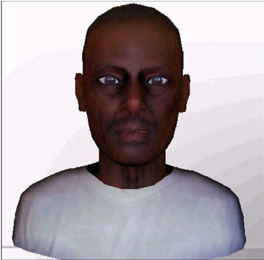
Appendix Figure 1. Still frame of virtual human (VH) with cues representing male gender, African-American race, older age, and low pain expression.