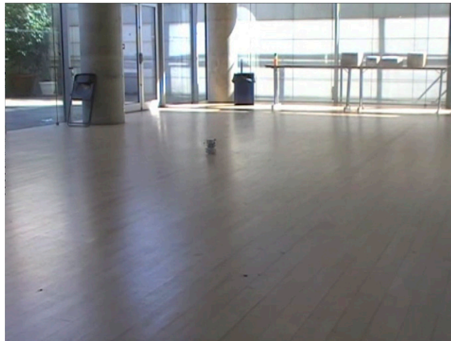
Movie S2. An experimental Mapless search without wind information. The speed of the video has been multiplied by 4.