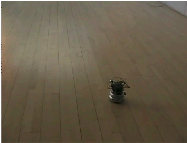
Movie S5. An experimental Mapless search with wind information. The speed of the video has been multiplied by 4.