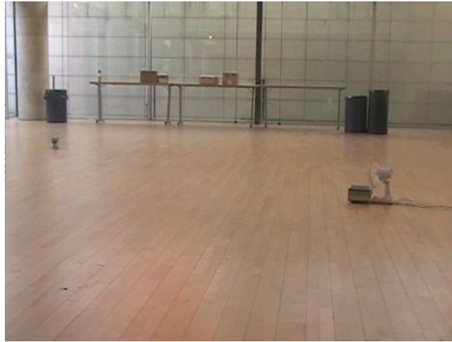
Movie S1. A very efficient experimental Mapless search without wind information. The speed of the video has been multiplied by 4.