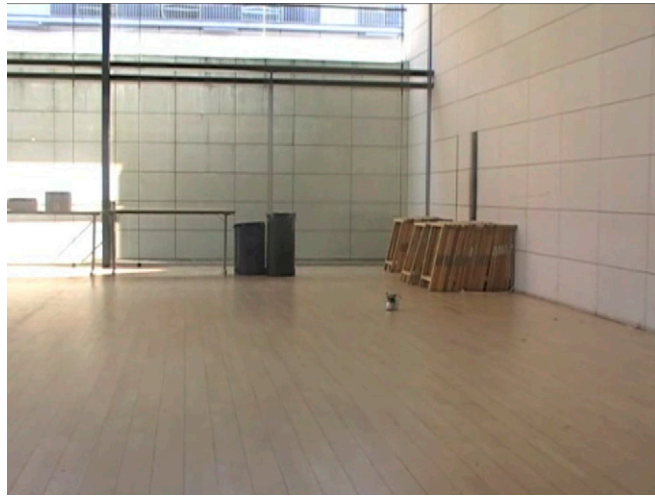
Movie S3. A long experimental Mapless search without wind information. The speed of the video has been multiplied by 8.