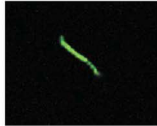
Supplementary Fig. 3b