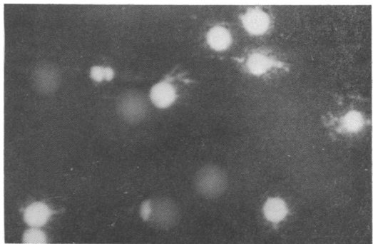
FIG. 2. Mixed culture containing serotype F colonies (M. bovimastitidis) stained directly with homologous antiserum. The large unstained colonies showing some autofluorescence stained with serotype C antiserum (M. laidlawii). The smaller and more distinct fluorescent colonies are showing some fluorescent peripheral area development. Note the positive fluorescent center within a large colony at the lower center indicating a mixture of serotypes within a single colony. \times 100 .

A dull yellow to yellowish green autofluorescence which varied in intensity was common with some strains of mycoplasmas when unstained or stained with heterologous antisera (Fig. 4). This was usually confined to the central portion of colonies but at times involved the entire colony. Care needed to be exercised so that autofluorescence not be confused with minor cross-reactions or poor staining from dilute antiserum. Autofluorescence tended to fade much more quickly upon exposure to ultraviolet light and caused difficulty in obtaining a good image. These characteristics were helpful in distinguishing