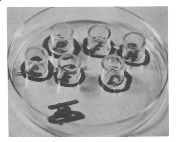
FIG. 1. Lucite cylinders pressed into agar media prior to staining colonies with conjugate. Conjugate and serotype designation can be seen on bottom of plate.

camera attached to the microscope. All dark-field (1 to 2 sec) and fluorescent exposures (8 to 15 sec) were made on Kodak high-speed Ektochrome EH 135 (ASA 160, DIN 23). All FA photographs were taken at \times 100 magnification.