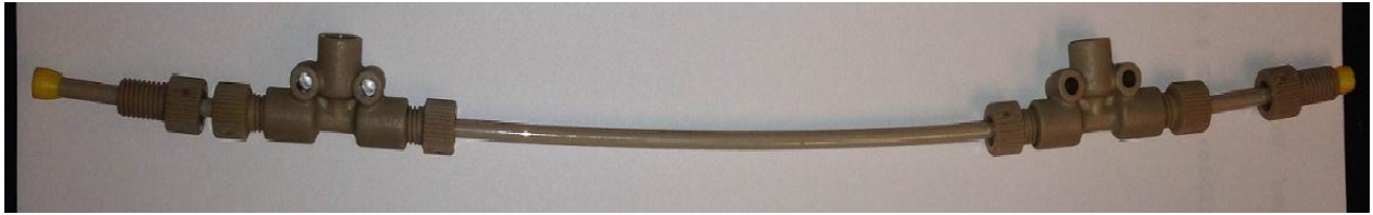
FIG S1 The hollow fiber membrane module