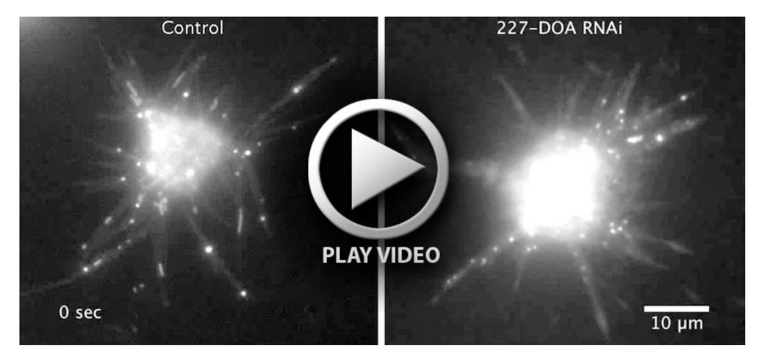
Movie 3. Effect of DOA knockdown on lysosome movement in S2 cells. Control cell is on the left panel, cell after DOA knockdown is on the right panel.