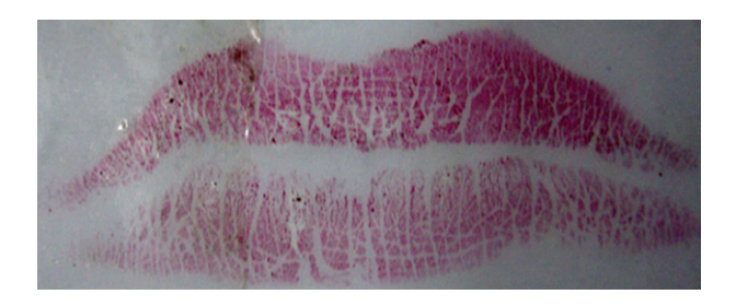
Figure 2 Photograph showing the lip print of a female subject.