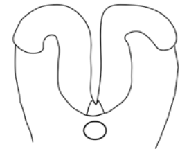
Spina bifida with reduced mesoderm