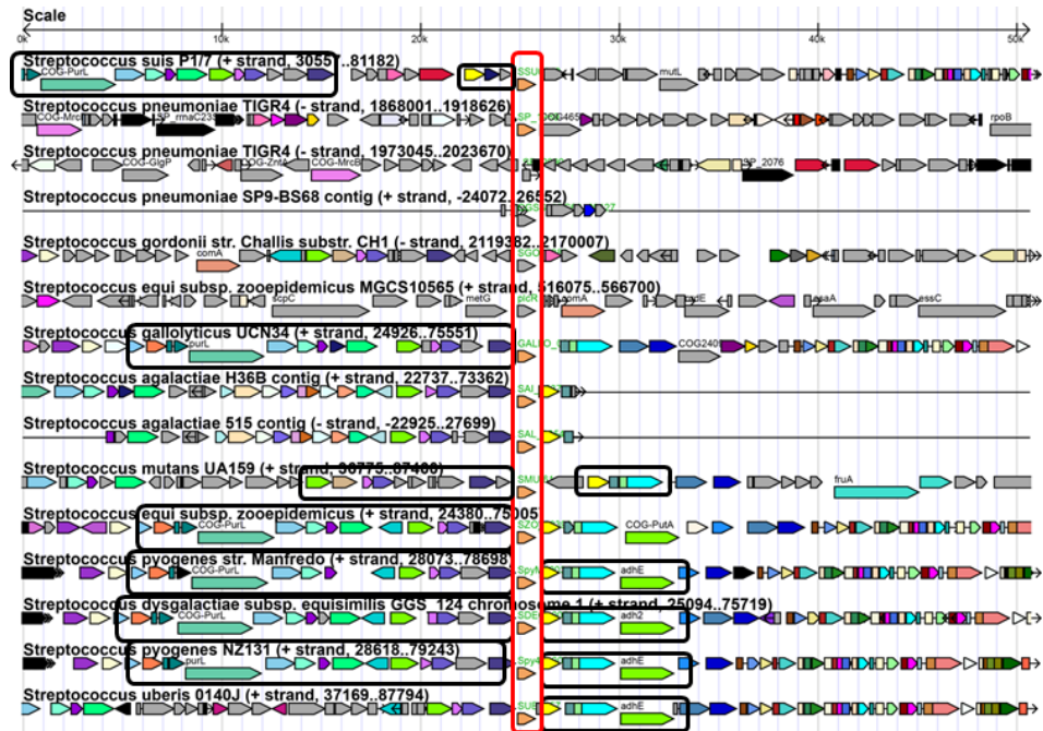
Figure 1. A) Overview of the comX region in the genome of different streptococcal species. The comX sequences have a sequence identity greater than 37%. Orthologous genes are represented with the same colors if amino acid identity was greater than 50%. B). Overview of the comRS locus in S. suis and in other representative streptococcal species. The comR sequences have a sequence identity greater 37%. Orthologous genes are represented with the same colors if amino acid identity was greater than 50%. (Red box): comR genes, (black boxes): conserved genes surrounding comR .