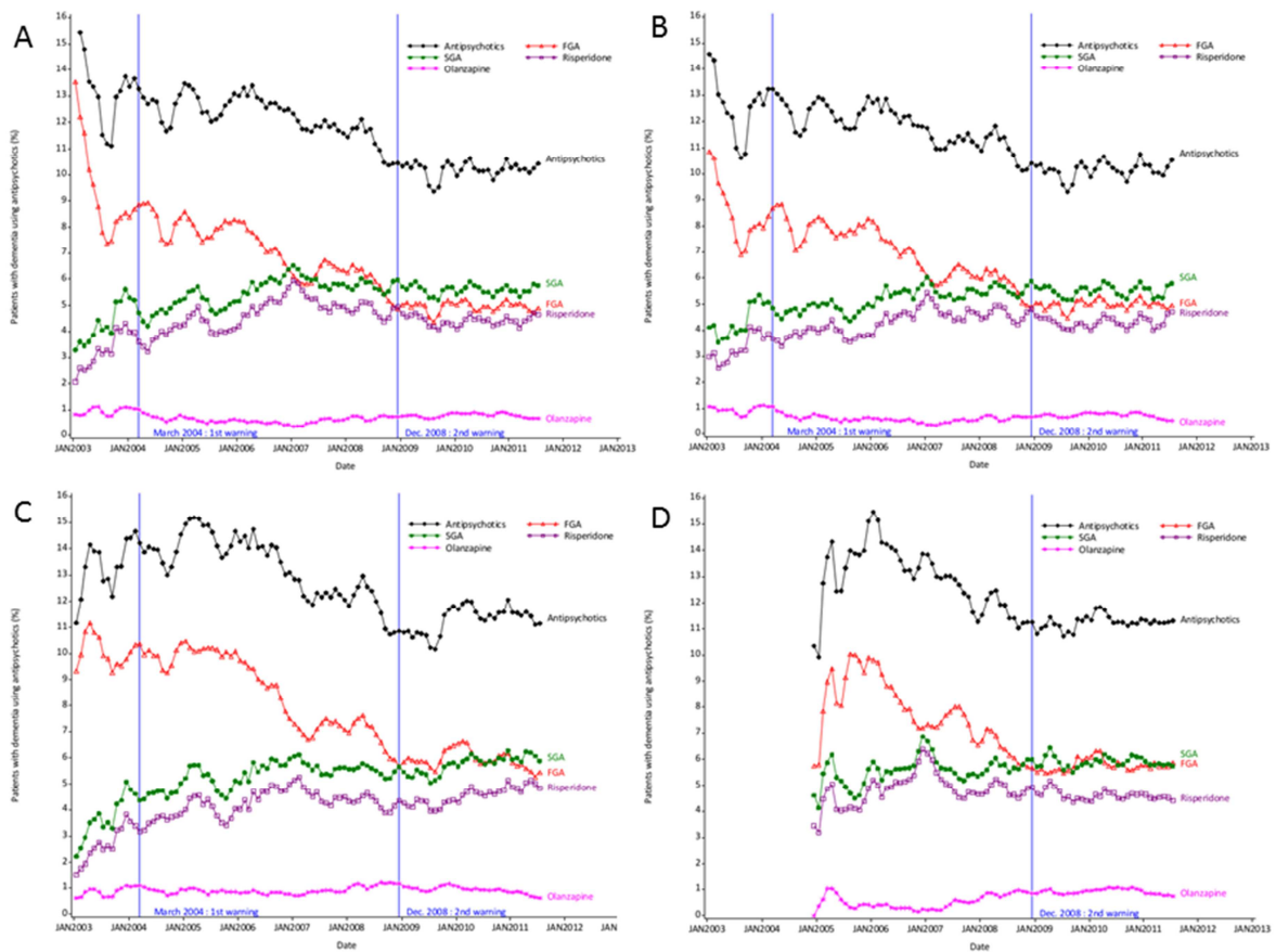
Supplementary Fig. 1 Trends in monthly prevalence of overall antipsychotic, FGA, SGA, risperidone and olanzapine use in patients with dementia according to criteria used to define dementia (3-month moving average series)

Graph A: patients with at least 2 dispensations of antidementia drugs over a 12-month period,