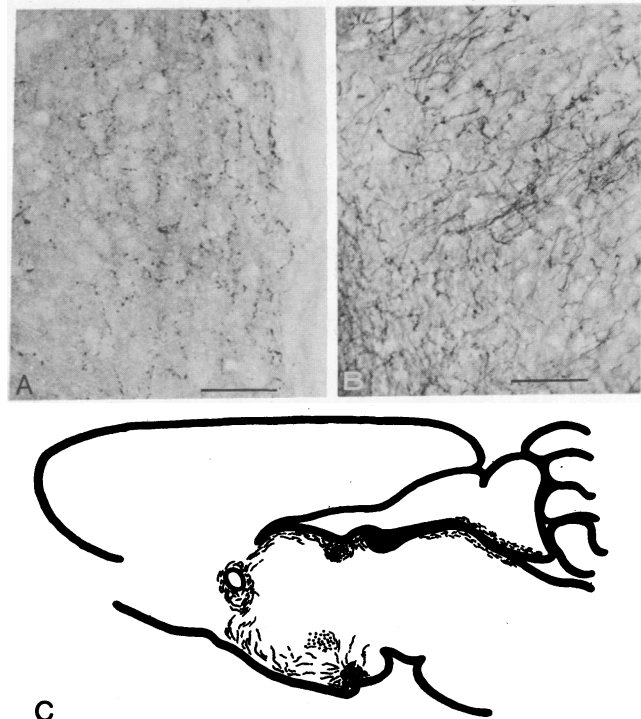
FIG. 2. (A) Immunoreactive varicose fibers within the periventricular nucleus of the hypothalamus after staining with antiserum RB 100 to \beta -endorphin that had been incubated overnight with 1 mM Leu 5 -enkephalin. Note that some fibers lie just beneath the ependymal cells lining the third ventricle. (Calibration bar = 25 \mu m.) (B) Immunoreactivity of myelinated axons in hippocampus after staining with antiserum RB 263 to \beta -endorphin. After absorption with purified rat myelin basic protein (1 mg/ml), all reactivity in hippocampus was eliminated. (Calibration bar = 25 \mu m.) (C) Schematic sagittal view of \beta -endorphin-reactive neurons and fibers in the rat brain. The neuronal perikarya in the basal hypothalamic region give rise to fibers that sweep forward along the routes indicated to enter the preoptic area and then to course within the periaqueductal region of the diencephalon and pons.

By using the unlabeled antibody peroxidase procedure, staining patterns were investigated in some detail with a second antiserum to \beta -endorphin that had been purified to the Ig fraction and then further purified by affinity chromatography on a Sepharose column to which \beta -endorphin had been conju-