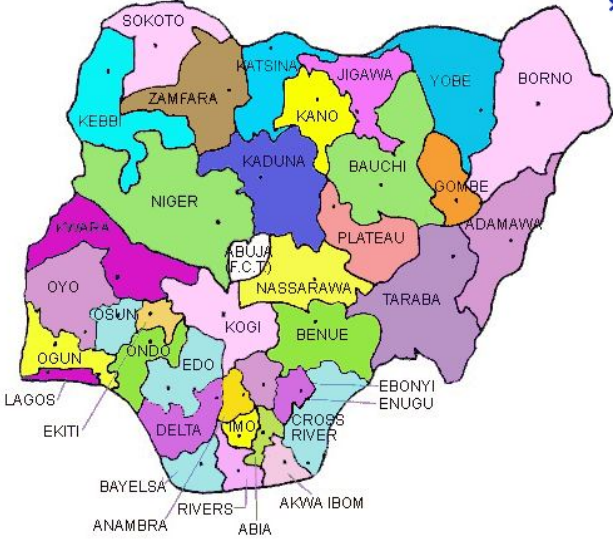
Figure 1. Map of Nigerian States