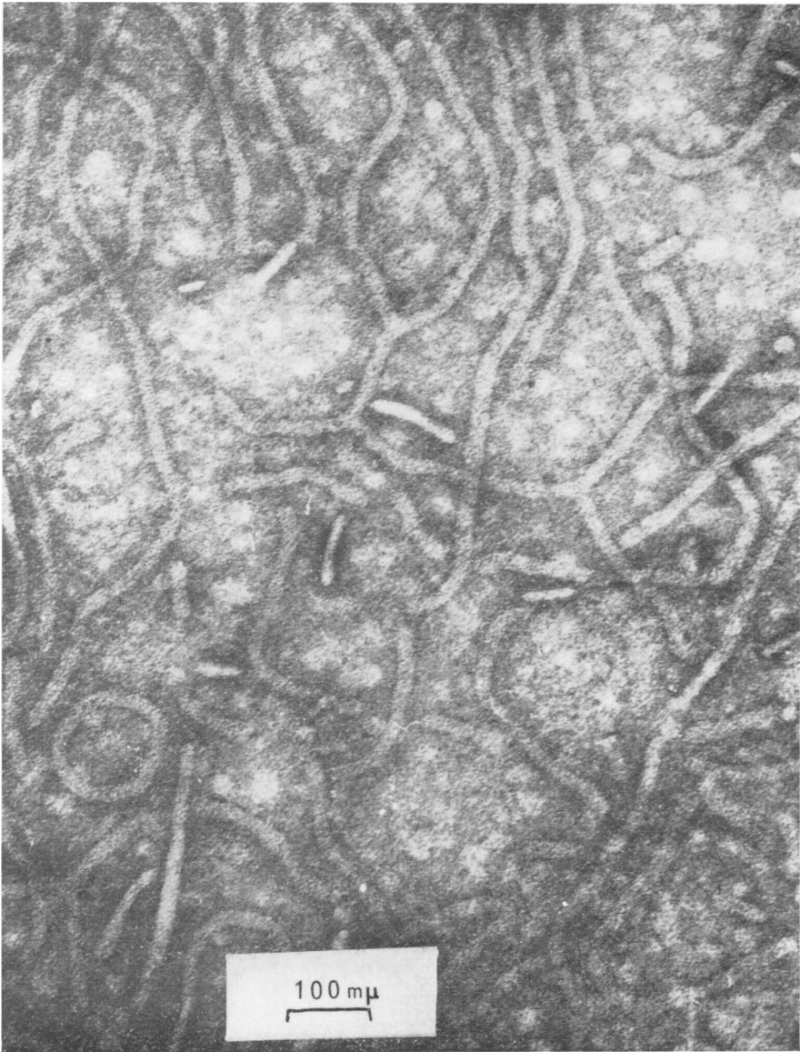
FIG. 1. LPS in 0.005 M Mg^{2+} ; negatively stained with 2% uranyl acetate.

curred only in those cell populations which sustained lethal complement damage. Very little release of label was observed from cells which survived; these presumably escape significant complement damage to their outer lipid membrane.