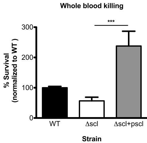
Fig S2: Sci-1 enhances survival in whole blood.

The survival of WT, \Delta scl and complemented strains in total killing assays was analyzed using whole human blood. Data were normalized to the survival of the WT strain to account for donor-dependent differences, and data from at least three independent experiments were combined. Results are given in average \pm SEM and analyzed by one-way ANOVA with Tukey's multiple post-test (**P<0.001).