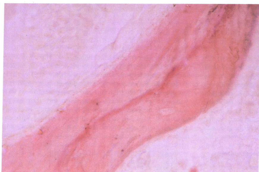
Figure 2. (bottom) Microscopic appearance of a bone biopsy from a group 2 dog after vitamin D repletion and continued aluminum administration. A previously unstained 5- \mu m section, reacted with a histochemical stain, has evident red-stained aluminum in a cement line. The presence of aluminum in the cement line indicates that mineralization had occurred at an osteoid-bone interface where aluminum had been previously deposited.