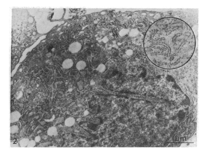
FIG. 2. Normal human fibroblast treated with platinumpyrimidine complex showing the nuclear staining and the ribosomes. Note the absence of patches at the plasma membrane. Inset shows enlarged view (3\times) of the endoplasmic reticulum outlined by the ribosomes.

Chemicals. The platinum-pyrimidine stains were freshly prepared in batches in our laboratory by R. G. Fischer and H. J. Peresie, and stored under reduced pressure. All batches were checked for similar quality by solubility and absorption spectroscopy criteria. All experiments included controls stained with the same batch. The stain solutions were freshly prepared and filtered through Whatman paper just prior to use. It is our experience that these stains are oxidized when exposed to air over long periods of time (weeks).