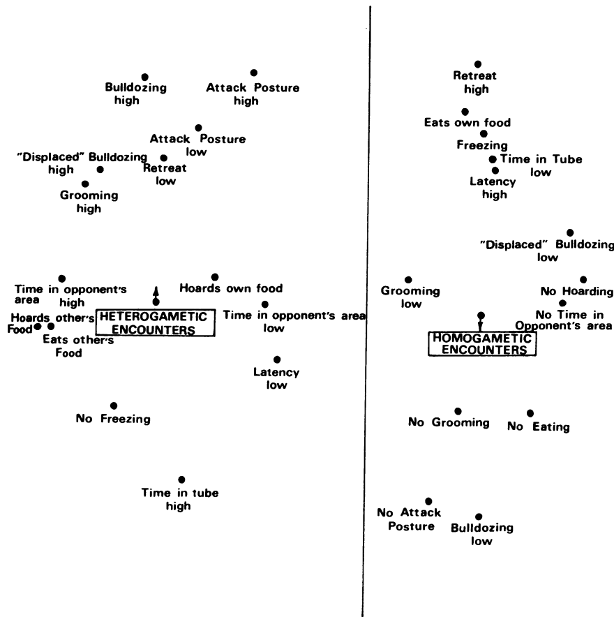
FIG. 2. First two dimensions of three-dimensional SSA-II space diagram of 27 behavioral categories in the testing apparatus. For further explanations see text.

kept in tin cages with sawdust bedding and received the same diet of carrots, onions, and potatoes.