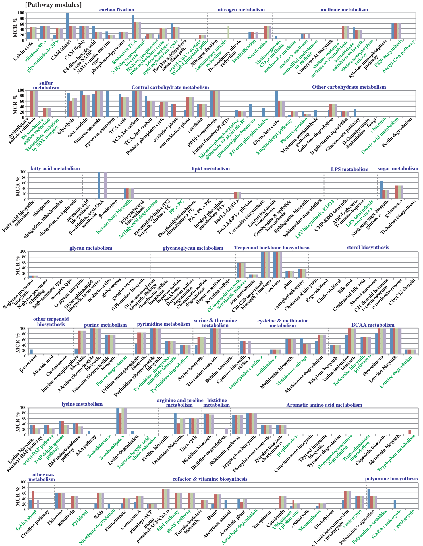
Figure S1 Comparison of the MCR pattern of uncultured Ca. ‘ Caldiarchaeum subterraneum ’ with those of representative species within Thaumarchaeota . MCR: module completion ratio, Green shows restricted modules [19], Complete name of each module is described in Table S3. ■, Ca. ‘ Caldiarchaeum subterraneum ’; ■, Ca. ‘ Nitrososphaera gargensis ’; ■, Cenarchaeum symbiosum ; ■, Nitrosopumilus maritimus