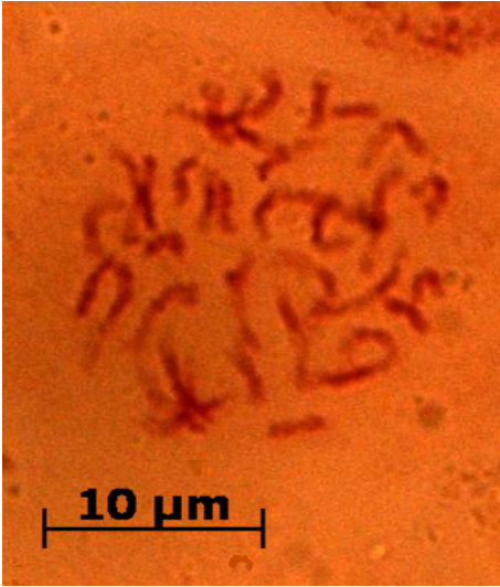
(A) E. oryzicola (4X)