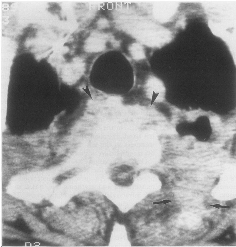
Figure 2 Computed tomogram of the chest: section through the apical regions. Abnormal contrast enhanced tissue is infiltrating the muscles of the posterior chest wall (arrows), the prevertebral soft tissues (arrowheads), and the anterior epidural space; note anterior bone destruction.

the apicodorsal bronchus of the left upper lobe. Cytological examination of bronchial washing and brushing specimens were negative for malignant cells. A computed tomography guided percutaneous needle biopsy of the tissue invading the posterior chest wall showed non-specific inflammation and fibrosis. Cultures of sputum, bronchial washing, and percutaneous needle biopsy samples grew P aeruginosa and were negative for mycobacteria. Treatment was started with intravenous ceftazidime (2 g) and tobramycin (80 mg), both three times a day. Six weeks later all signs and symptoms had resolved except for persistent numbness in the fourth and fifth fingers of the left hand. On a repeat chest radiograph the air-fluid level in the left upper lobe cavity had gone. Computed tomography of the chest showed almost complete disappearance of the abnormal tissue infiltrating the thoracic inlet. Because of associated vertebral osteomyelitis treatment was continued with oral ciprofloxacin (750 mg, twice daily) for two months.