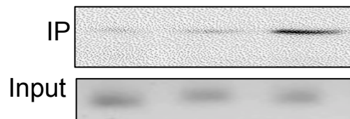
Supplementary Figure S1 Weekes et al