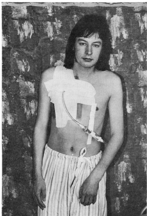
FIG. 3. Patient immediately after completion of procedure.

The area around the tube insertion is further sealed with Vaseline gauze and adhesive tape. The connection between catheter and valve is similarly sealed. The valve is attached to the chest wall, ensuring that the distal end is unimpeded (Fig. 3).