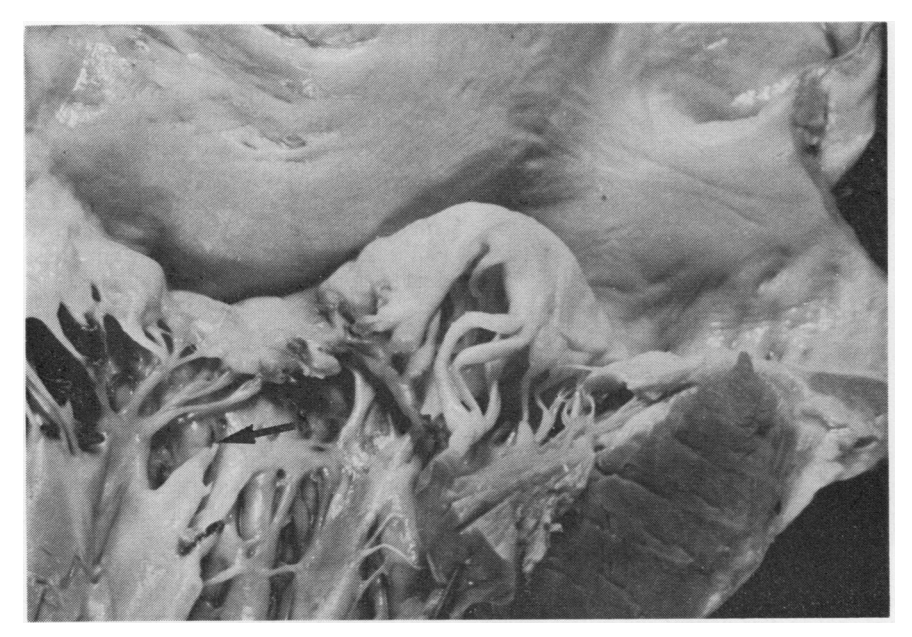
FIG. 3. Case 2. The posterior cusp of mitral valve is nodular and thickened due to myxomatous change. The arrow points to the site of chordal rupture.