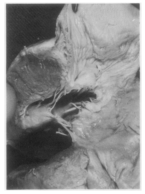
FIG. 4. Case 3. The mitral valve leaflets have the characteristic thickened, nodular appearance of myxomatous change, but in this patient the mitral incompetence was considered to be due to dilatation of the mitral annulus.

The mitral valve cusps were thickened, nodular, and opalescent but were not ballooned, and their chordae were intact (Fig. 4). There was considerable dilatation of the mitral annulus which