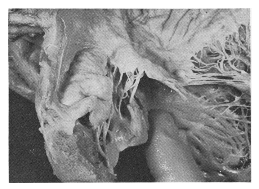
FIG. 2. Case 1. The mitral valve shows ballooning of the anterior leaflet (left), which appears coarsely nodular and thickened. The posterior leaflet (right) shows similar nodularity and thickening but to a lesser degree.