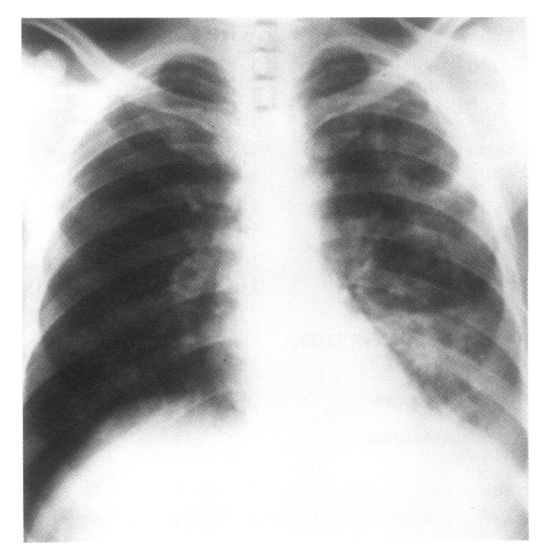
Figure 1 Chest radiograph of a patient with tuberculosis showing a left pleural effusion and left lower lobe involvement, features found less commonly in M kansasii infection than in tuberculosis.

Further radiological findings are presented in table 1. Pleural effusions were not seen in the M kansasii group but were present in 15 of