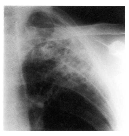
Figure 4 Chest radiograph of a patient with tuberculosis showing a large cavity in the left upper lobe containing an air fluid level, a feature not seen in M kansasii infections.