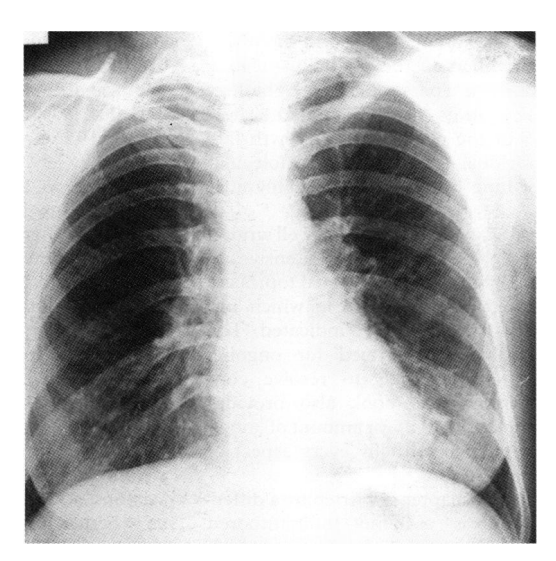
Figure 2 Chest radiograph on the eighth day of treatment with hydrocortisone.

two months. As the dose of hydrocortisone was reduced, metronidazole was added for 10 days to avoid relapse. There was no relapse on follow up, now at 34 months. The asthma is well controlled with inhaled steroids (1000 µg daily) and inhaled salbutamol when needed.