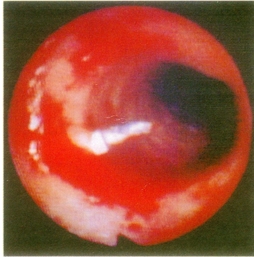
Figure 1 Bronchoscopic view of transtracheal cannula through which the pH probe is inserted. The probe can be positioned under direct vision to ensure its stability and contact with the tracheal wall.

duodenoscope, respectively, under general anaesthesia using intravenous suxamethonium and propofol. Local anaesthetic agents were avoided as these are known to be acidic and might influence the results. 11 The 1 mm tracheal pH probe was passed through the cricothyroid membrane via a 14 gauge cannula (Wallace, Colchester, Essex, UK) (fig 1) and placed in the trachea 2 cm above the carina. The position of the pH probe was confirmed using a flexible Olympus BF3 fiberoptic bronchoscope and its stability confirmed by subsequent radiography. The oesophageal pH probe (1.5 mm) was positioned 5 cm above the lower oesophageal sphincter, a position previously determined by oesophageal manometry and verified by endoscopy.