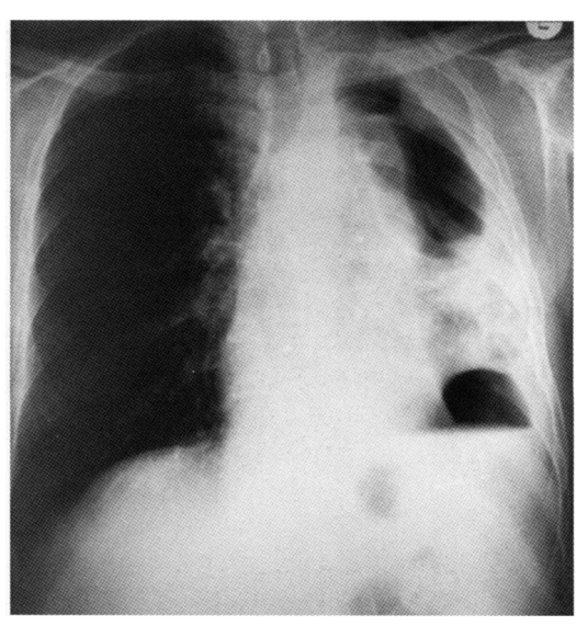
Figure 1 Chest radiograph showing two bullae in the left

diet and an oral hypoglycaemic agent. He had never smoked and had no relevant occupational exposure. His chest symptoms persisted in spite of two courses of antibiotics. Chest radiography showed an infiltrate in the left mid zone without cavitation or elevation of the diaphragm. Bronchoscopic examination showed an inflamed, patent left main bronchus with multiple areas of ulceration. Abundant acid fast bacilli were seen in the bronchoalveolar lavage fluid. He was started on 300 mg isoniazid, 600 mg rifampicin, and 1.5 g pyrazinamide daily. Culture of lav-