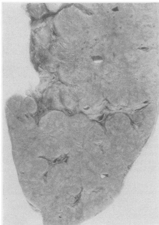
Fig 1 The cut surface of the liver after fixation showing variably sized, ill defined nodules.

The liver was very small, weighing 592 g. The