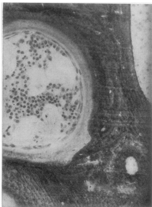
Fig. 1 Human cancellous bone of iliac crest showing a layer of pale staining osteoid tissue lining the trabecular surface. Undecalcified, 5 \mu section (H & E \times 165).

In all the material studied, sections stained with haematoxylin and eosin showed a layer of pink-staining osteoid tissue covering part of the bone surface and separating the osteoblasts from the blue-staining bone tissue (Fig. 1). Thinner sections, approximately 2 microns in thickness, could be prepared only with specimens of cancellous bone, and in these a thin but virtually continuous layer of osteoid tissue was found to cover the bone surface except where active resorption was taking place. This layer of osteoid tissue was approximately 1 micron in thickness, and could be seen only at a high magnification (Fig. 2): it was covered by small