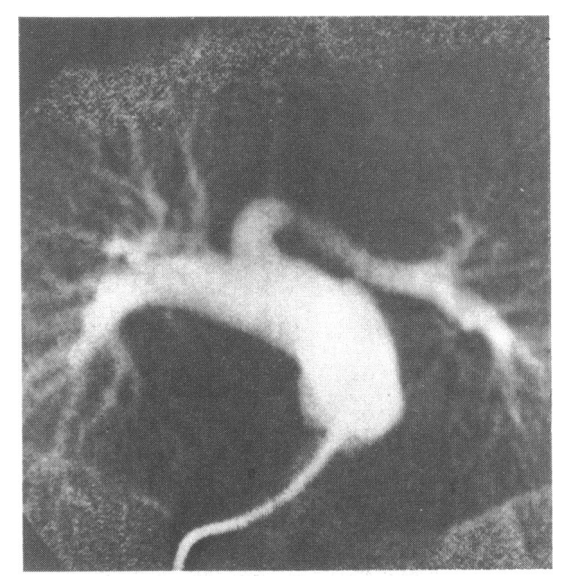
Fig. 3 Pulmonary angiogram in a child aged 18 months, (weight 11.5 kg) with a left pulmonary artery sling. 0.7 ml/kg of iopamidol 123 mg I/ml was used with a radiation exposure of 32.25 nC/kg/s (125 \mu R/s).

used routinely in the absence of shunts or valve regurgitation, and volumes of contrast medium varied from 0.8 ml/kg to 1.2 ml/kg. Contrast medium containing only 123 mg I/ml gave adequate images of a pulmonary artery anomaly (Fig. 3). Excellent visualisation of lesions in the distal aortic arch was obtained in three patients by the injection of 1 ml/kg of iopamidol (370 mg I/ml) into the pulmonary artery (Fig. 4). Fourteen patients with isolated pulmonary or aortic valve lesions were studied. Abnormal valve leaflet motion was identified in all cases (Fig. 5), the minimum peak systolic pressure gradient being 35 mm Hg.