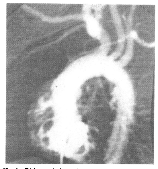
Fig. 1 Right ventricular angiogram in a patient aged 10 months (weight 7.7 kg) with transposition of the great arteries. 1.3 ml/kg of iopamidol 185 mg I/ml was used with a radiation exposure rate of 32.25 nC/kg/s (125 \mu R/s).