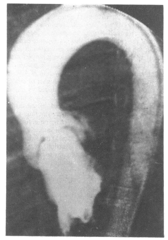
Fig. 5 Left ventricular angiogram in a patient aged 14 years (weight 37 kg) with valvar aortic stenosis (peak systolic gradient 50 mm Hg). 0.9 ml/kg of iopamidol 185 mg I/ml were used with a radiation exposure of 129 nC/kg/s ( 500 \mu R/s ).

(Fig. 4). Where both great arteries filled almost simultaneously from a ventricular angiogram and the great arteries were superimposed analysis in time interval difference mode allowed clearer visualisation of the anatomy (Fig. 2). Small left to right shunts were easily identified after right heart injections of contrast in both modes of processing.