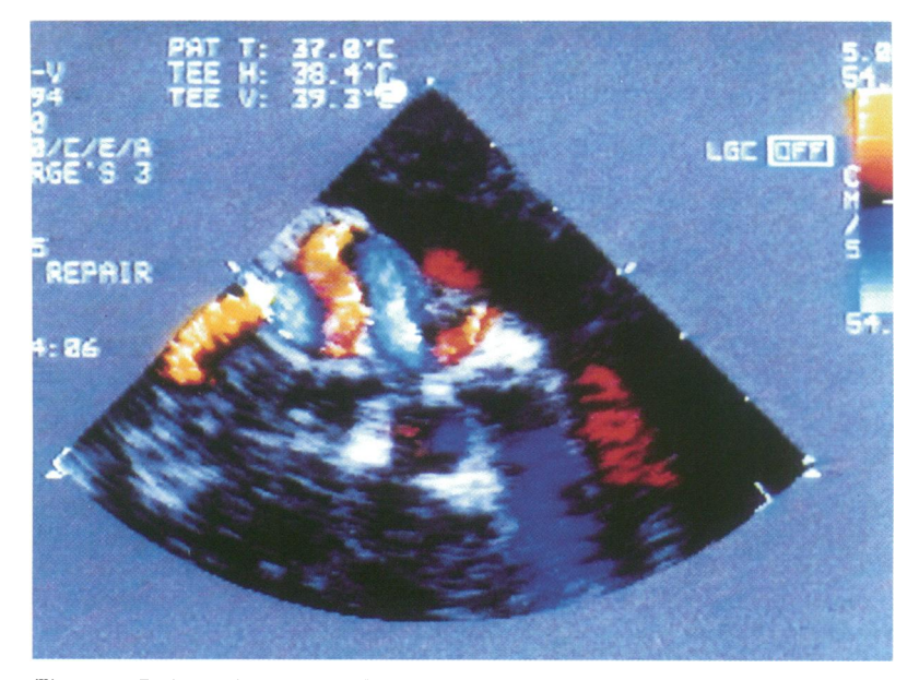
Figure 2 Perioperative transoesophageal echocardiogram of the tortuous coronary fistula. Colour flow Doppler demonstrates the presence of residual flow in the fistula despite initial distal surgical ligation.

because, although they are often asymptomatic, such fistulas may lead to significant late complications.<sup>23</sup> Initial surgical ligation of