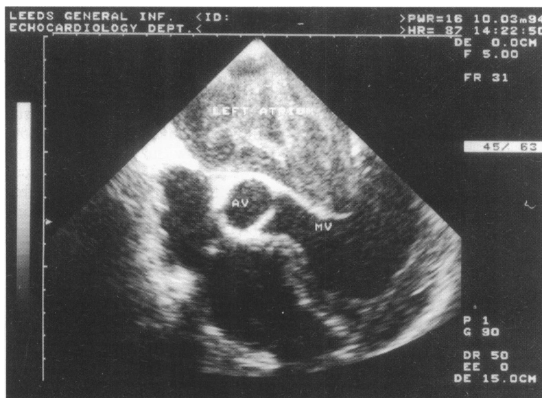
Figure 2 Spontaneous echo contrast in the left atrium. AV, atrial valve; MV, mitral valve.

model was constructed using a stepwise technique, including all variables with univariate P < 0.1 . Analyses were performed using SPSS 6.1 for Windows.