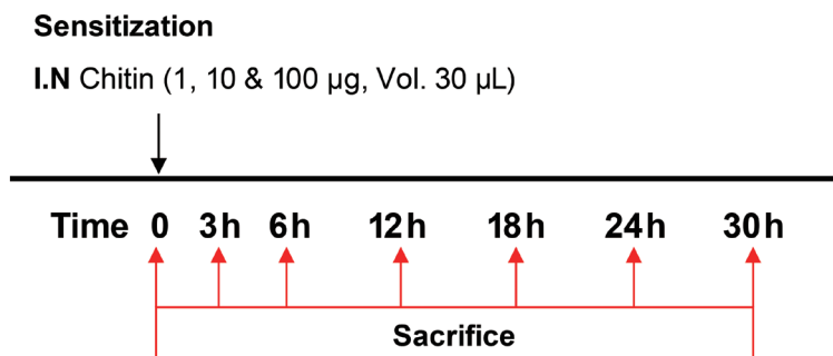
Supplementary Fig. 1. Schematic protocols for animal models.