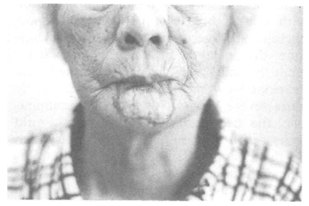
Case 1: Hypoesthesia is present on Figure 1 the lower lip and chin as shown.

The salient findings common to all three cases is the markedly atrophic mandible. In 1806 Charles Bell, in his "Essays on the anatomy of expression in painting", described the characteristic facial features of