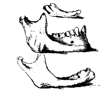
Figure 2 Mandibles of infant (top), adult (middle) and elderly person (bottom) by Charles Bell.4

elderly people as due to the lack of teeth and of that part of the jawbone which supports them. Fig 2 is taken from his monograph,<sup>4</sup> and clearly illustrates the markedly atrophic mandible in the elderly. It is worth emphasising that the site of the mental foramen is changed as the bone becomes atrophic. In the markedly atrophic mandible, pressure around the outlet of the foramen causes pain.