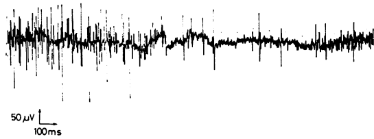
Fig 3 Neuropathic pattern in CPS with giant potentials in same patient as in fig 1.