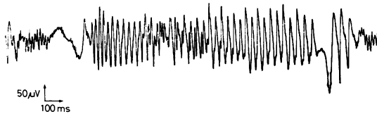
Fig 5 Bizarre high frequency discharges in PCA.

impairment of intellect and mild dementia.