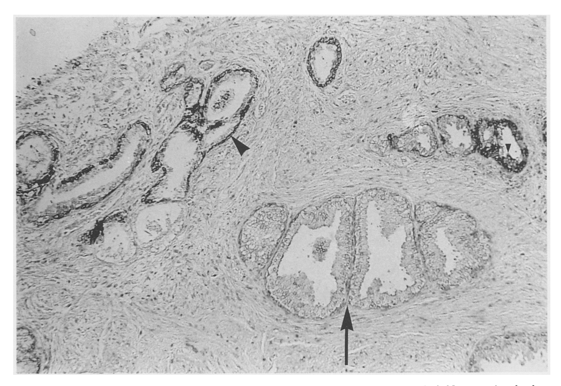
Figure 1 EAB 903 immunoperoxidase staining of benign prostatic glands using the IIP method. Note negative glands (arrow), basal cell staining in some glands (arrowhead), and superficial cell staining focally (small arrowhead).

Needle biopsy, by the transrectal or perineal routes, is an increasingly popular method of diagnosis in prostatic practice. Relatively small amounts of tissue are available from this technique in comparison with transurethral resections or total prostatectomies, thus magnifying the degree of diagnostic difficulty.