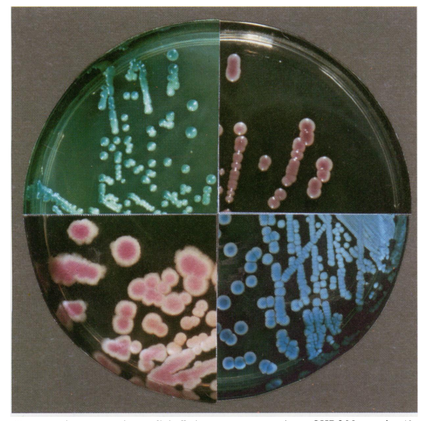
Figure 1 Appearance of some clinically important yeast species on CHROMagar after 48 hours of incubation. Clockwise from 12 o'clock: C glabrata, C tropicalis, C krusei, C albicans.