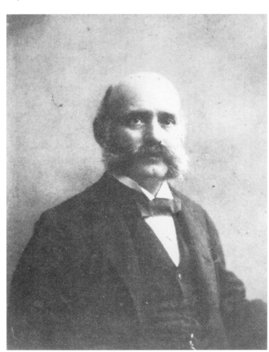
Figure 3 Carl Weigert.

Bohmer in 1865 combined alum with haematoxylin to form a distinctive albeit imprecise stain for cell nuclei.<sup>12</sup> More selective nuclear staining was achieved when in 1886 Ehrlich (fig 2) added acetic acid to the solution.<sup>13</sup> A number of the earlier alum haematoxylin solutions are still very much in use today and include those of Ehrlich of 1886, Harris 1900, and Mayer's haemalum 1903. Harris was an American born in 1875 about whom little is known. Paul Ehrlich was one of the giants of German medical science with significant contributions to bacteriology, haematology, and immunology as well as histology. He was cousin to Carl Weigert (fig 3), another famous figure. Much of Ehrlich's creative work was carried out in Berlin and Frankfurt, where he was to die in 1915 at the age of 61. Paul Mayer, who died in 1923 aged 78, was of German-Italian extraction and spent much of his working life as a histologist at the Zoological Station in Naples, Italy. As well as his haematoxylin solution he is also remembered for the mucicarmine and mucihaematein techniques for mucin, both published in 1896. The use of haematoxylin is not, of course, restricted to the demonstration of cell nuclei. Other uses have appeared and include staining for myelin in 1889, muscle in 1900, elastin in 1908, and, in more modern times for neuroendocrine cells (1969), etc.