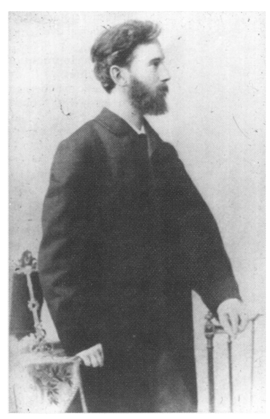
Figure 2 A young Paul Ehrlich.

Reichel in the 18th century<sup>6</sup> and in a commercial sense in the 1840s.<sup>9</sup> The active stain ingredient is created by oxidation, and it was Mayer in 1891 who demonstrated that the compound so formed was haematein.<sup>10</sup> Waldeyer is credited with the introduction of haematoxylin in 1863 as a tissue stain,<sup>11</sup> although this is not without dispute.