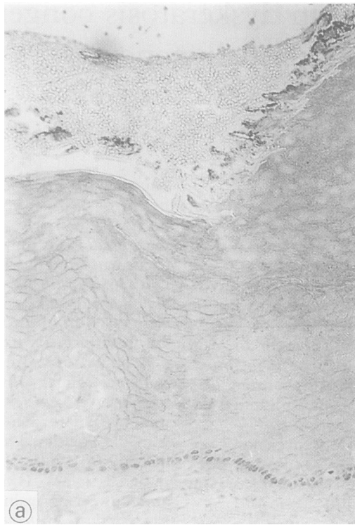
Figure 1B Section of the biopsy specimen taken in 1987 (haematoxylin and eosin.)