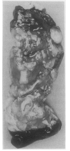
Figure 2 A breast biopsy specimen, 10 cm long, differentially marked with Bismark brown (superficial), India ink (deep), plain gelatin (medial), henna (lateral) and paprika (superior). The set gelatin is responsible for the glistening appearance.

Figure 3 Photomicrograph of a breast biopsy specimen with the resection margin marked with a solution of gelatin coloured with turmeric. Note the distinctive cerebriform starch particles.