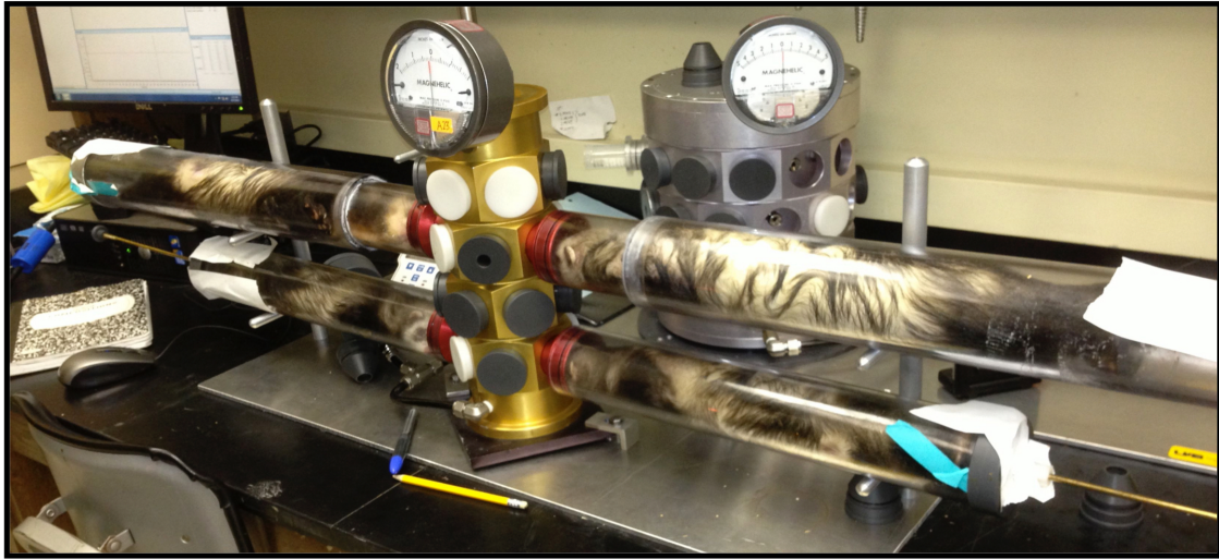
Supplemental Figure 1. Cigarette smoke exposure system for ferrets. Picture of ferrets undergoing cigarette smoke exposure in controlled apparatus.