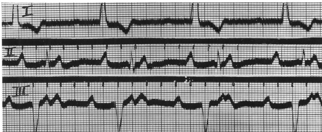
FIG. 1.—Case 8. The degree of heart block is probably complete, but it has the appearance of 2 : 1 block—a condition that is rare, if not unknown, in congenital cases—because the auricle is beating almost exactly twice as fast as the ventricle. The inversion of T in lead I has developed in the last ten years.

Case 8. The diagnosis was first made when he was 13 years. He was under observation at Guy's