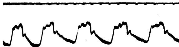
FIG. 1.—Carotid arteriogram in a patient with aortic incompetence and stenosis in whom carotid shudder was observed.

The sign was recorded by placing a tambour over the carotid pulsation and connecting it with a Mackenzie's polygraph. Records obtained in this way were examined alongside those obtained in healthy subjects and in patients with lone aortic incompetence or with hypertension producing a kinked carotid. The tracing in carotid shudder, of which that shown in Fig. 1 is representative, was taller than in health, but no taller than the one obtained in