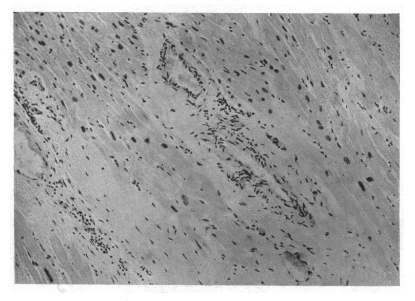
FIG. 3.—Section of the left ventricular myocardium showing interstitial fibrous replacement of muscle and areas of lymphocytic infiltration.

of the coronary arteries was found, there was no evidence of thrombosis in the branches. All four heart chambers contained organizing mural thrombi; the endocardium of the left auricle and ventricle was very thick (2.0 mm.), white and opaque. Similar changes were present in much less degree in the cavities of the right side of the heart. The tricuspid valve was normal; atheromatous deposits were seen on the pulmonary valve and in the pulmonary trunk. The cusps of the mitral valve were thickened and opaque and this thickening extended along the chordæ tendineæ to the papillary muscles. The aortic valve was competent but showed several warty deposits upon the ventricular aspect of its mitral cusp. The aorta was normally developed and showed no evidence of hypoplasia. Microscopic examination of the left ventricle showed gross fibrous thickening of the endocardium and fibrous replacement of muscle. The latter was most pronounced in the sub-endocardial region except for a band of muscle tissue which seemed to have escaped destruction. Generally, the myocardium showed irregular bands of fibrous tissue spreading for varying distances between muscle bundles and in places compressing them. This gross increase in connective tissue together with patchy lymphocytic infiltration resembled a chronic inflammatory process (Fig. 3). The areas of infarction showed the usual appearances, compatible with the age of the lesion.