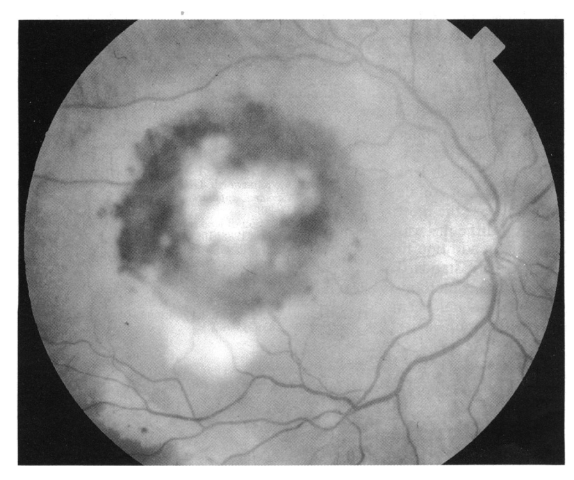
Figure 1 Fundus photograph showing submacular choroidal lesion of the right eye with overlying retinal haemorrhage.

Nocardia is an aerobic, Gram positive, branching filamentous micro-organism that is found with ubiquity in the soil. Human infection is rare and usually occurs in the form of a subcutaneous abscess or a pneumonia-like illness. Haemato-