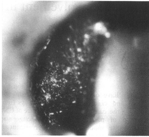
Figure 1 Patient with an anterior chamber flare and inflammatory cells in the vitreous. Visual acuity 20/30.